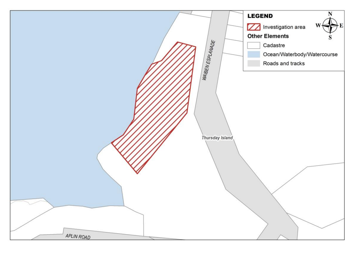
Figure 4.4 – Investigation Area – Thursday Island (Waiben Esplanade)