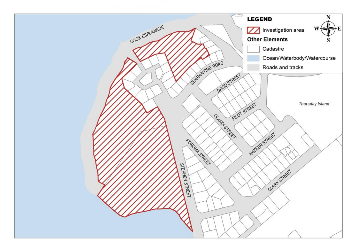
Figure 4.3 – Investigation Area – Thursday Island (Quarantine)