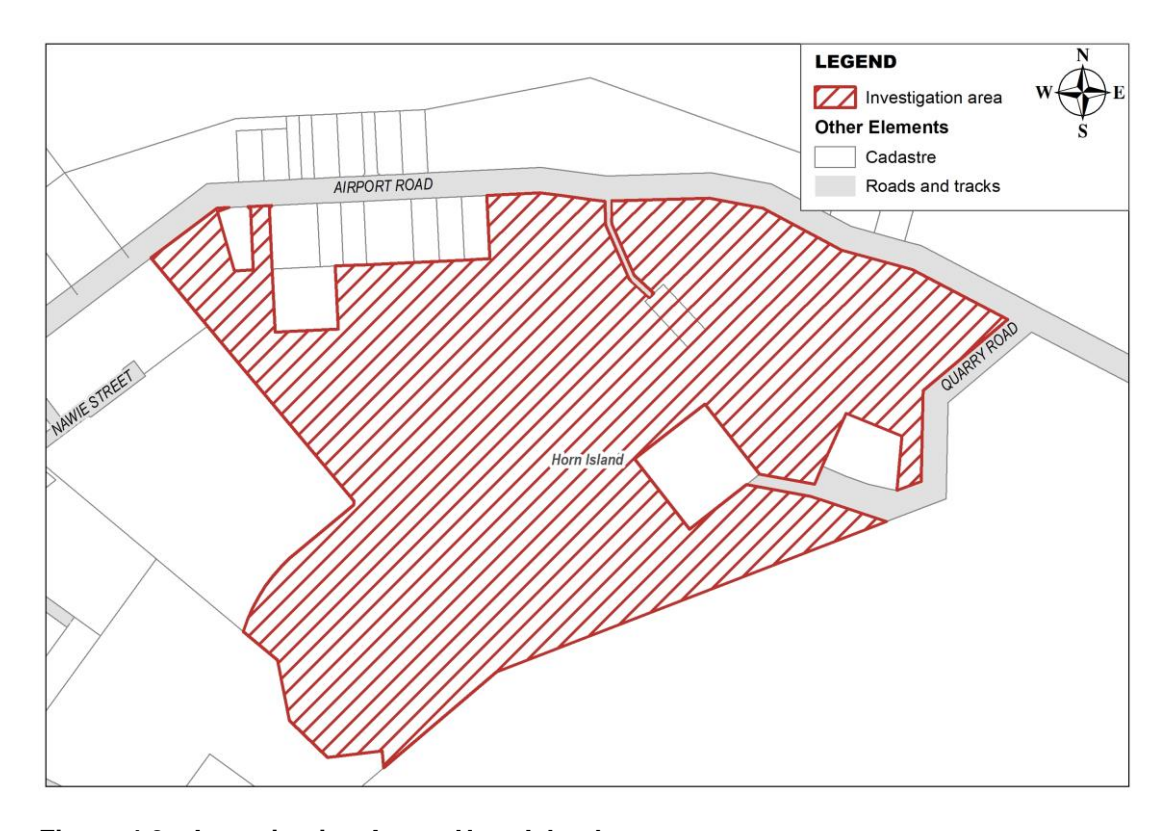
Figure 4.2 – Investigation Area – Horn Island