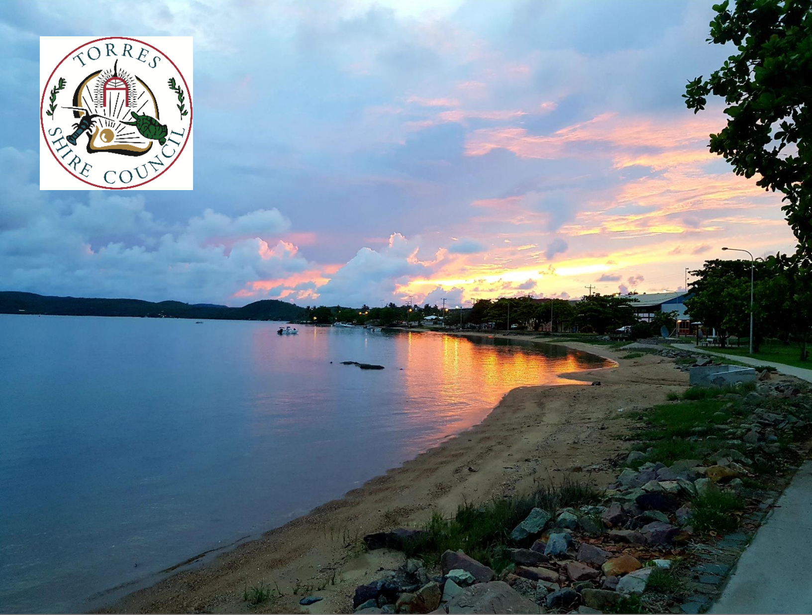
Sunset at Victoria Parade, Thursday Island